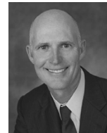
Rick Scott (R)