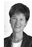
Alex Sink (D)